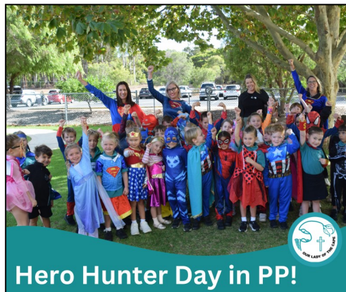
Hero Hunter Day in PP!

Wishing everyone a blessed Easter and a relaxing school holiday break. If you know of anyone who is interested in finding out a bit more about our lovely school, please suggest that they view our website, view our school video, or call the school for a no-obligation tour and chat with our Principal. https://ladyofcape.wa.edu.au/